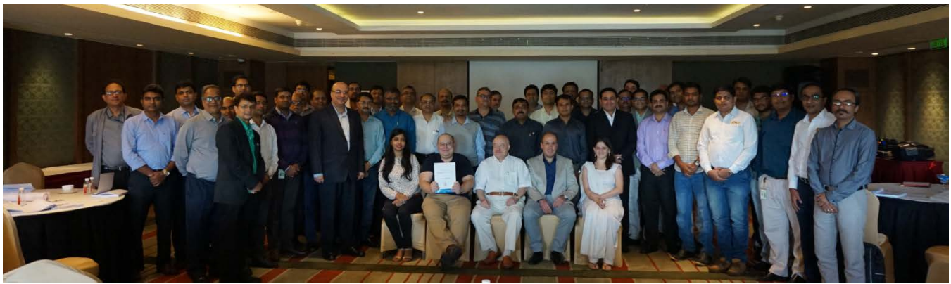
Participants and guests of the workshop