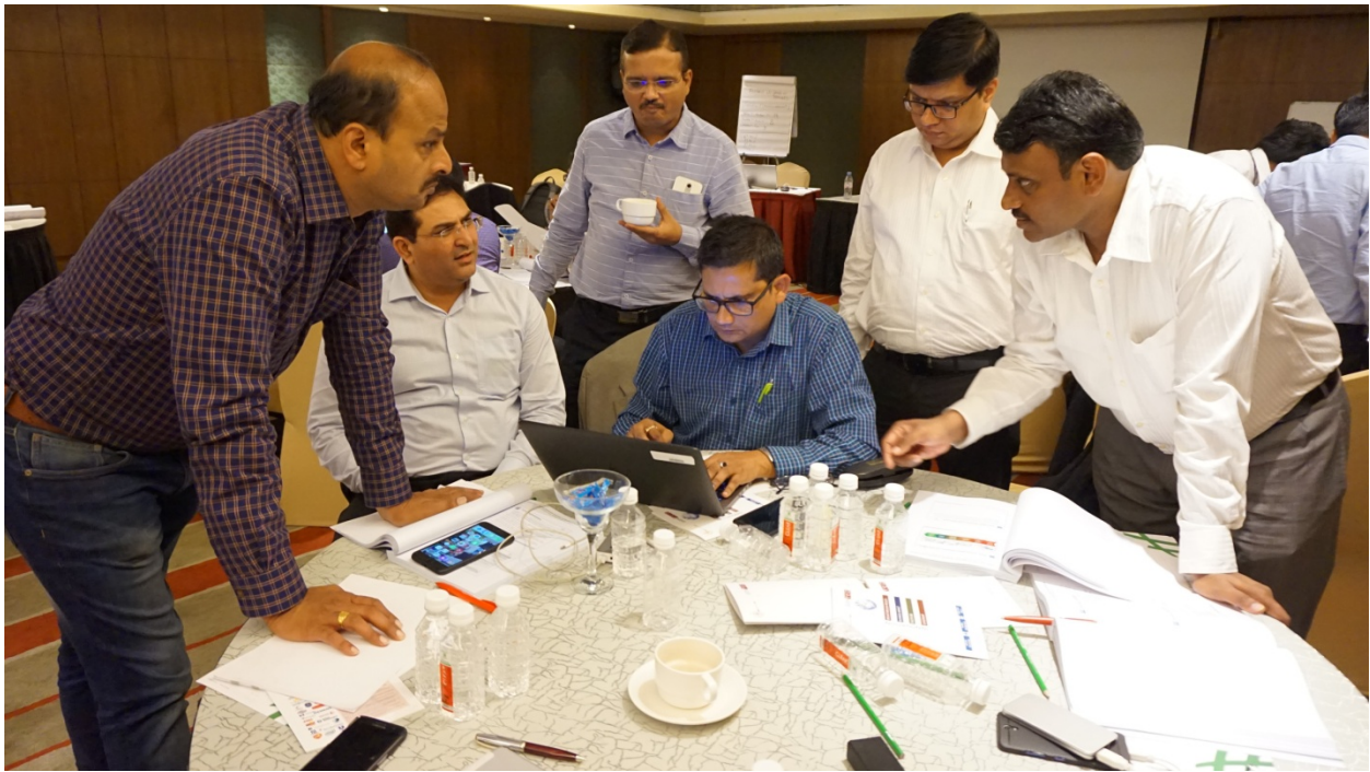
Participants are applying TRIZ tools they learned

Then, there was a day of workshop on “Demystifying Strategic Innovations” where TRIZ Master Oleg Feyngenson explained the modern TRIZ tools including MPV analysis and pragmatic S-curve analysis. Over 50 people participated.