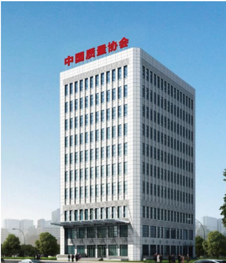
No.6 Bai Sheng Cun, San Hu Qiao, Haidian District, Beijing, China

The buildings are located directly across the street from one another.